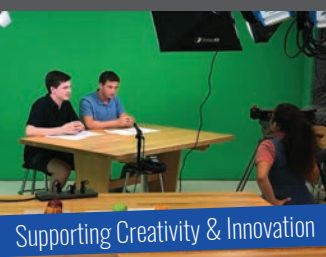
Supporting Creativity & Innovation

The Byram Hills Education Foundation is a volunteer-run non-profit organization dedicated to enhancing the education of all students in Byram Hills. A collaborative organization made up of educators, school administrators, and parents from our community, the BHEF has become the district's innovation engine.