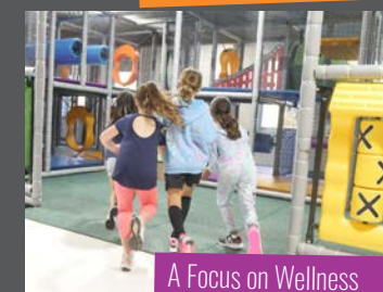
A Focus on Wellness