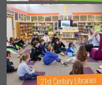
21st Century Libraries