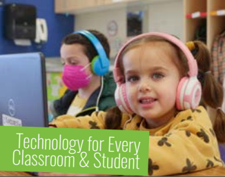
Technology for Every Classroom & Student