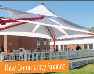
New Community Spaces